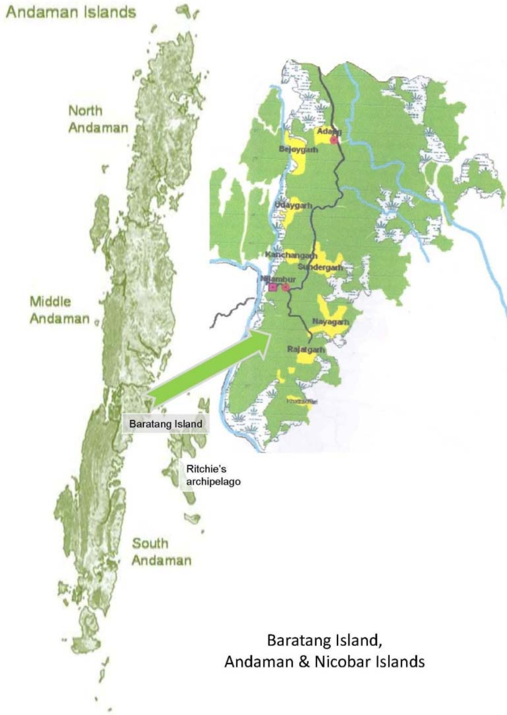
Figure 1. Map of the study area